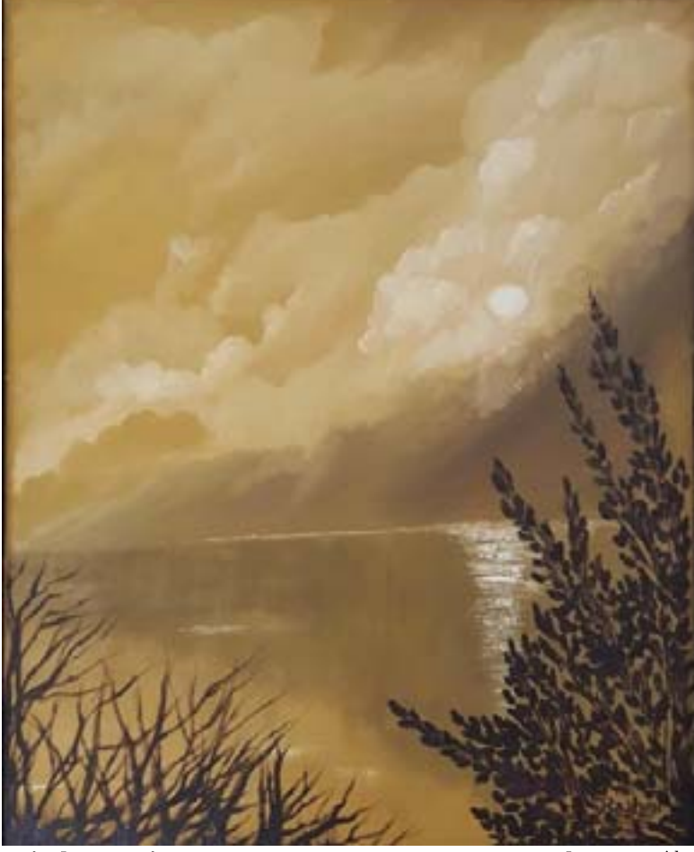
By Sora O'Doherty

The Lamorinda Arts Council, which manages both the gallery at the Orinda Library and the gallery at the Wilder Art & Garden Center, continues to offer online gallery exhibitions in the month of January: "African Wildlife in Photographs" at the Library Gallery and a virtual exhibit featuring 12 watercolor and oil paintings by Rashmi Rajesh at the Art Gallery at Wilder.